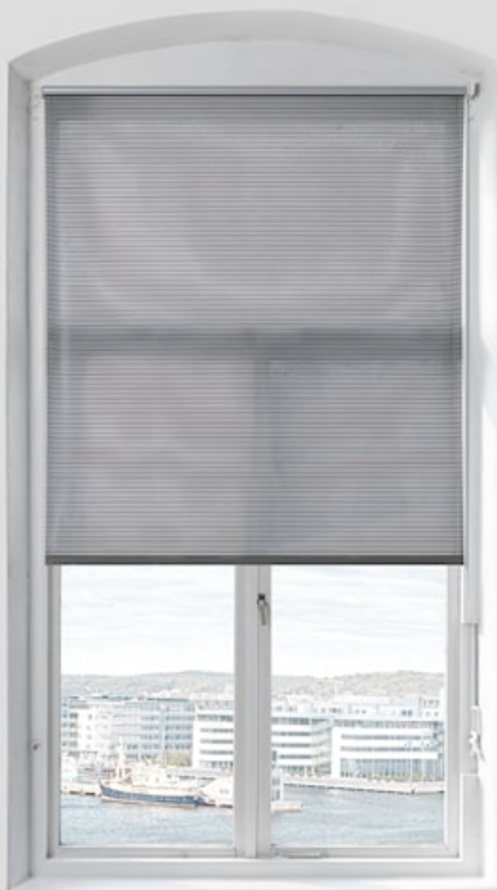
VOLT Hanging fabrics