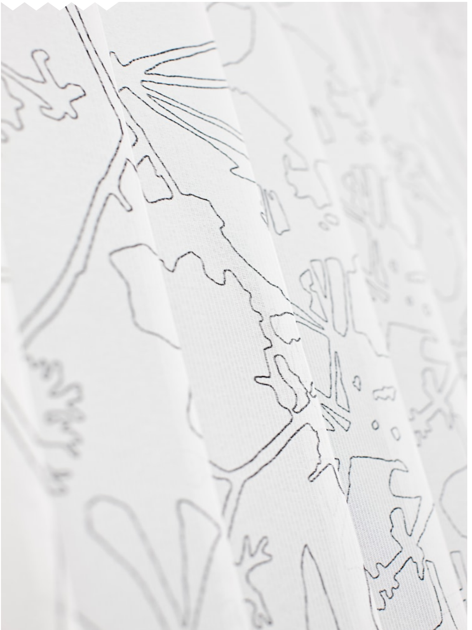
EDEN 89 MM Hanging fabrics